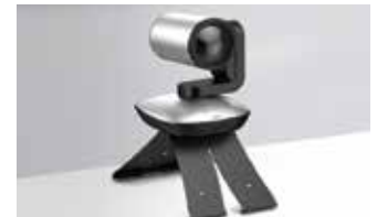
Elevated to eye height