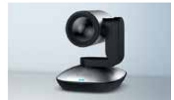
Sitting on table or ledge