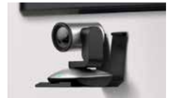
Mounted on wall

For an even easier connection experience, quickly pair NFC-enabled mobile devices to the CC3000e by simply touching them together. And whether the user connects with Bluetooth ® or NFC, the CC3000e is programmed to remember only the last mobile device it was paired to for security and convenience.