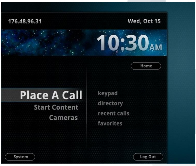
Easy to Access Menus