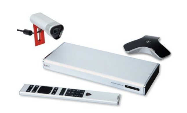
RealPresence Group 300