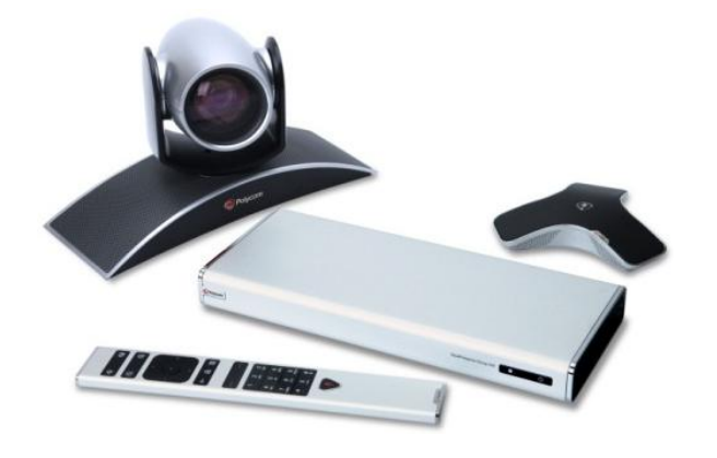
RealPresence Group 500