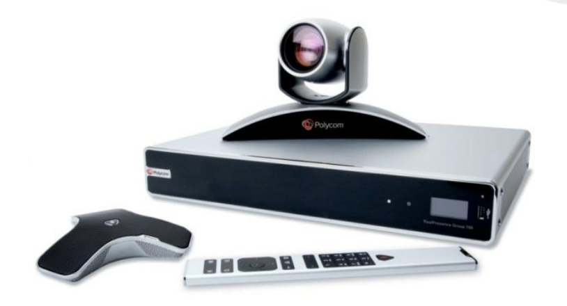
RealPresence Group 700